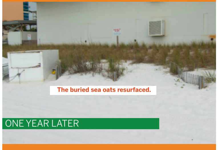
AFTER HURRICANE MICHAEL

Fences are 1ft above ground after the storm deposited a 3ft layer of sand on the berm.