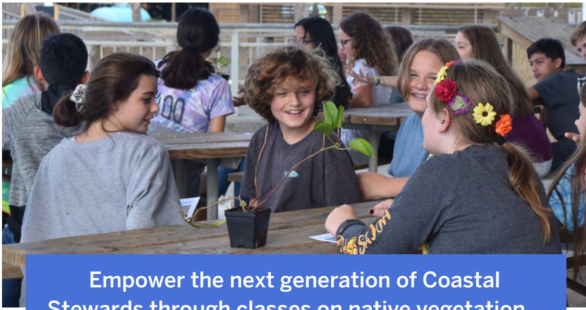
Empower the next generation of Coastal Stewards through classes on native vegetation.