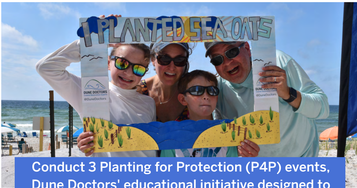
Conduct 3 Planting for Protection (P4P) events, Dune Doctors' educational initiative designed to promote coastal stewardship.