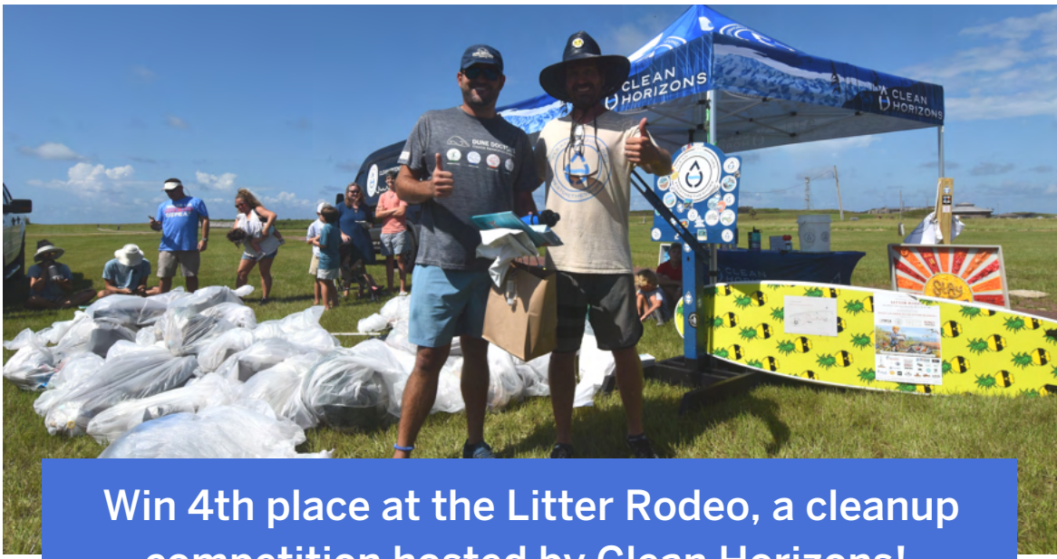
Win 4th place at the Litter Rodeo, a cleanup competition hosted by Clean Horizons!