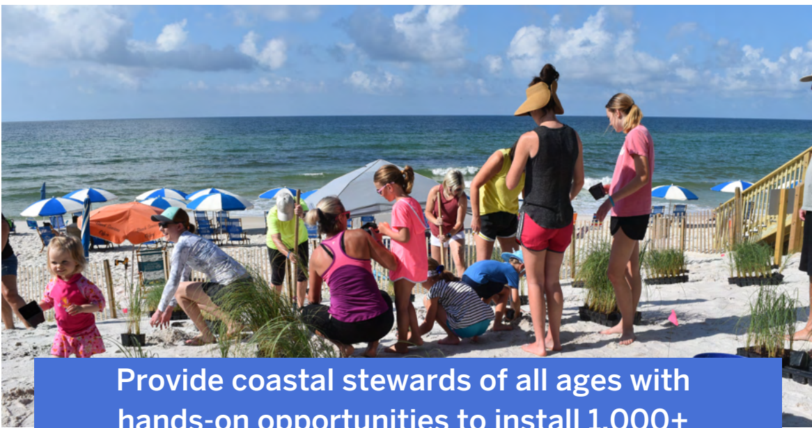
Provide coastal stewards of all ages with hands-on opportunities to install 1,000+ native coastal plants at the P4P events.