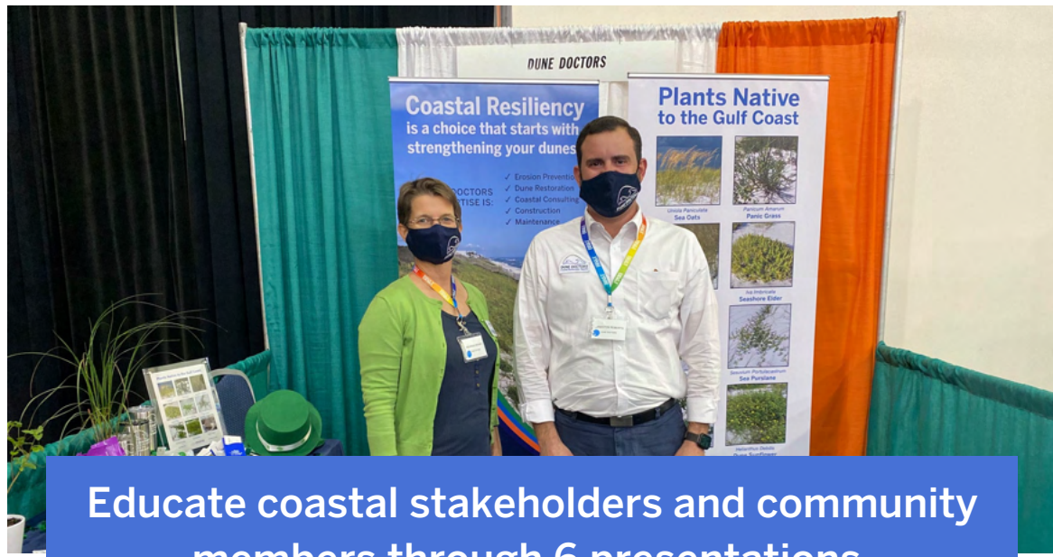
Educate coastal stakeholders and community members through 6 presentations.