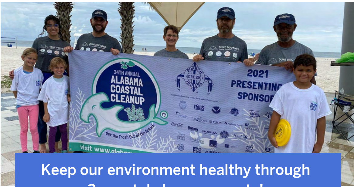
Keep our environment healthy through 3 coastal cleanup events!